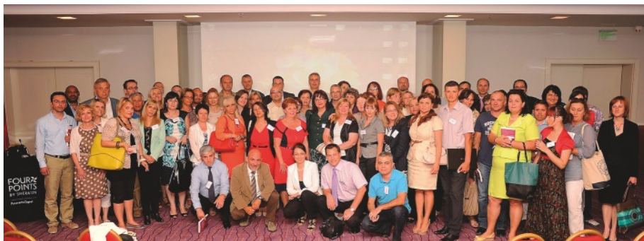
Picture 23: Country delegations and NFPs