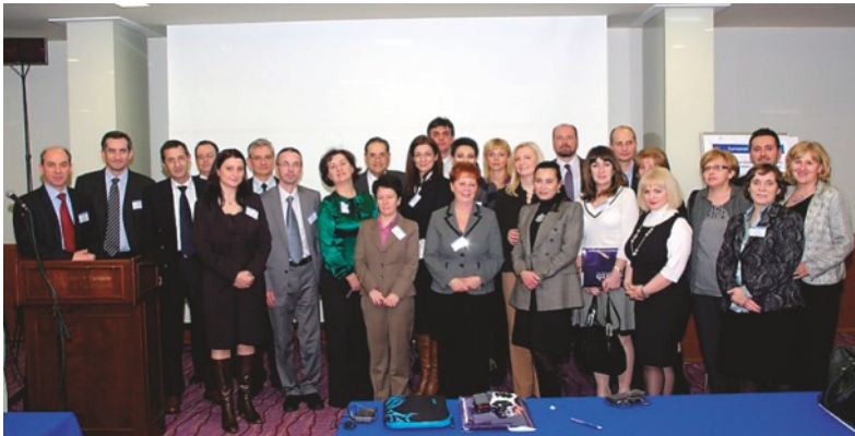
Picture 5: Introduction of the regional network of National Focal Points