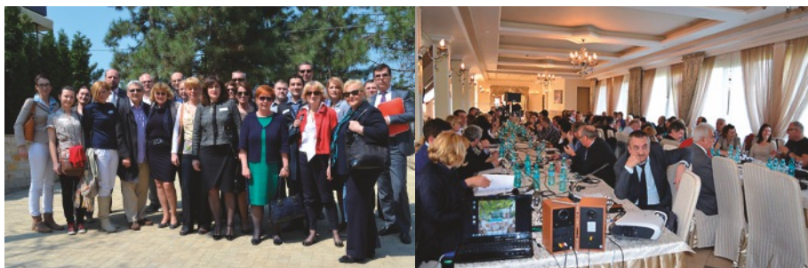
Picture 21, 22: Workshop on Funding Models for Deceased Donation and Transplantation and Meeting of National Focal Points within SEEHN

Multi-Country Workshop on Funding Models for Deceased Donation and Transplantation was hosted and organized in collaboration with the Moldova Transplant Agency, in the context of the Presidency of the Republic of Moldova to SEEHN, within the framework of the TAIEX Instrument. The workshop presented overview of the funding models for deceased organ donation and transplantation programmes in the European countries. The reimbursement models for donor hospitals and organizational models were elaborated by different Competent Authorities.