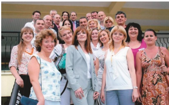
Picture 19: Multi-country workshop on Technical Requirements for Donation and Procurement of Organs and Kidney Transplant Management

Workshop on Technical Requirements for Donation and Procurement of Organs and Kidney Transplant Management in conjunction with the Nephrologist Congress (62 participants)