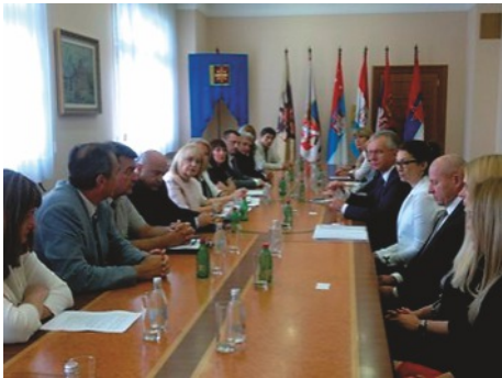
Picture 41: Serbian Health Minister Slavica Djukic Dejanovic and Croatian Health Minister Rajko Ostojic signed Memorandum of cooperation in health

In June 2013 in close cooperation between Clinical Hospital Merkur (Zagreb) and Clinical Hospital Centre Serbia liver transplant programme in Serbia has been revitalized; two liver transplants were successfully performed in Belgrade.