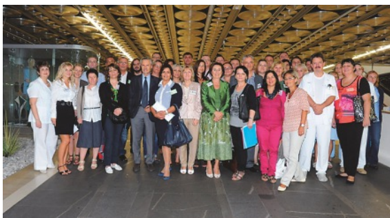
Picture 20: Workshop on brain death diagnostics and Meeting of National Focal Points within SEEHN

Workshop on brain death diagnostics (36 participants)