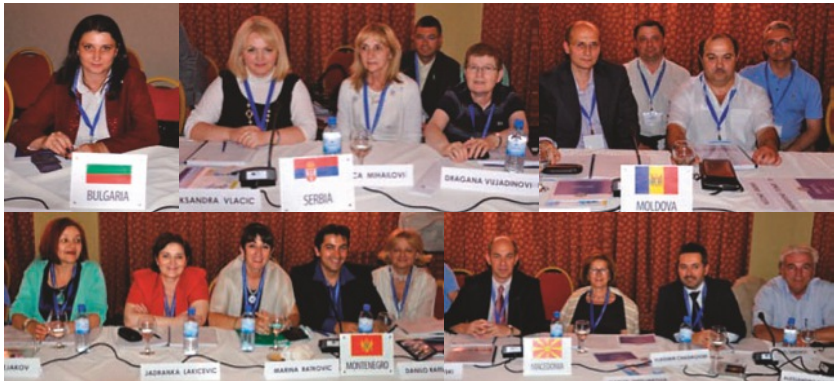
Picture 6, 7, 8, 9, 10: Country delegations presenting data and discussing country-specific objectives

The Skopje meeting was jointly organized and guided by RHDC Croatia collaborating partners; TTS, ESOT, ETCO, ISODP, in support of regional professionals and SEEHN countries national health authorities to analyse country-specific needs reported in the Questionnaire.