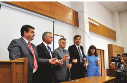
Picture 37, 38, 39: The first living related kidney transplantation in Montenegro