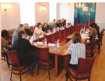
Picture 31: Meeting at the Ministry of Health of the Republic of Bulgaria