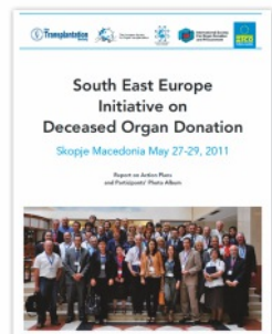
Picture 11: SEEHN member countries delegations and representatives of professional societies (ESOT, ISODP, ETCO, TTS)